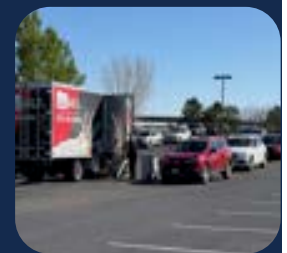
THE LINE OF CARS AT THE APRIL 18 SHRED-A-THON

Many of our Friends, volunteers and book shoppers are familiar with our annual Shred-a-Thon – this year, we made some changes! First, we moved the Shred-a-Thon to spring! The date was Saturday, April 18, from 9 a.m. to noon. Second was the location. The spring Shred-a-Thon took place in the parking lots of the Jefferson County Fairgrounds at 15200 W. 6th Avenue in Golden.