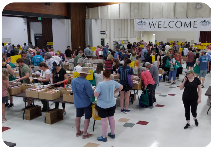
THE MAIN SALES FLOOR.

For more than two decades, and at each individual event, JCLF's Whale of a Used Book Sales have offered up more than 80,000 gently used books, CDs, DVDs, vinyl records and many more items. These sales enable the Foundation to raise thousands of dollars in support of the many free programs, services, and activities offered by Jefferson County Public Library.