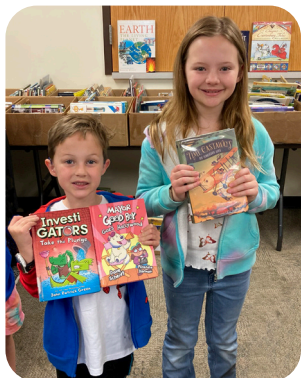
THE CHILDREN'S AREA HELD TREASURES FOR KIDS OF ALL AGES (PARENTS, TOO)!

The last day of the sale, Sunday June 2, was Bag Day—a day when shoppers can fill a grocery-sized bag of books for just $10! This year, we partnered again with CSU Extension, which offered shoppers the opportunity to enjoy children's activities and gain information on many Extension programs, including Master Gardeners and 4-H.