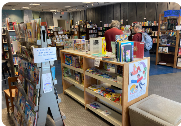
WHALE'S TALE TWO BOOKS AND GIFTS AT BELMAR SHOPPING CENTER

Do you love books and love being around books? We always need volunteers to help staff these two stores. Shifts run from 3 to 3.5 hours each, and volunteers earn a 20% discount to use at both Whale's Tales.