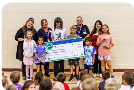
SCHOOL CONTEST WINNER CHECK PRESENTATION

The Summer Challenge 2023 kept students' minds active with not only reading, but activities including art, STEM programs, math, and kids and teen camps where students learned about music, farming, robotics, STEAM, storytelling, magic, and much more! In addition to fun activities, there were great prize incentives for meeting individual reading and participation goals.