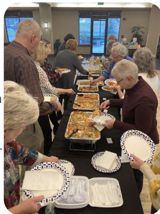
FRIENDS ENJOY A DELICIOUS LUNCHEON FROM BONO'S ITALIAN RESTAURANT