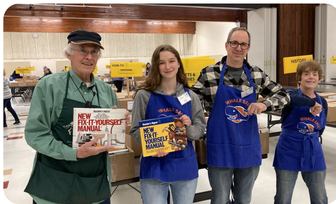
VOLUNTEER AT THE WHALE OF A USED BOOK SALE AND GET TWO FREE BOOKS FOR EVERY FOUR HOURS THAT YOU VOLUNTEER!

On Friday, June 2, the sale launches with Early Bird entry (for $10 per adult) from 8 a.m. to 9 a.m., and includes